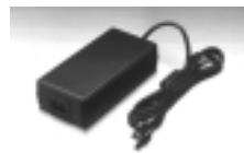
■ PS-170 (option) - Power supply unit