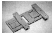
■ WH-10 (option) - Wall Hanging Bracket

ESC/POS® EPSON took the initiative in introducing ESC/POS, a POS printer command system enabling versatile POS system construction with high scalability. Compatible with all types of printers and displays, this proprietary control system also offers the flexibility for easy future upgrades. It has become popular in the world.