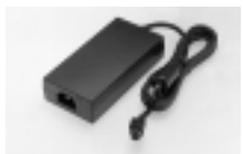
■ PS-180 (option) - Power supply unit