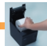
Step 2: Insert the paper roll.