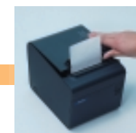
Step 3: Close the door. The paper is fed automatically.