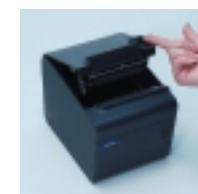
Step 1: Press the lever, open and pull down the door until it is fully open.

The TM-T90 is so easy to use that it requires almost no training for even the most inexperienced of staff. With no complicated paper feeding, the drop-in loading method allows operators to open the lid and load new paper in a few short seconds.