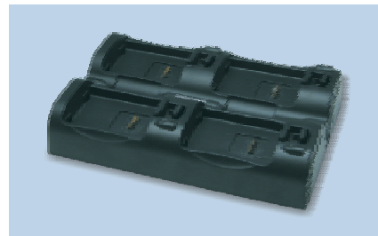
Multiple Battery Charger